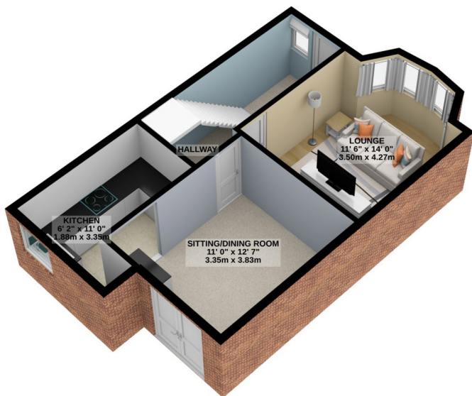
GROUND FLOOR 447 sq.ft. (41.5 sq.m.) approx.